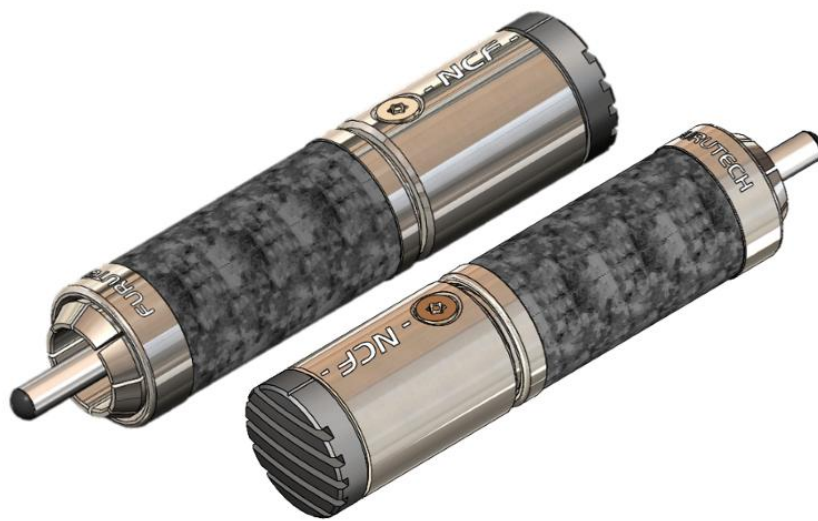
NCF Clear Line-RCA "Line Optimizer" (1pcs)

"Plug and play, you'll notice the effects immediately. With overwhelming improvement in S/N (signal-to-noise) ratio, you'll experience an increase in detail information, taking your listening or viewing experience to the next level and enhancing the reproduction of subtle nuances. Without coloring the sound, it brings out the original appeal of your sound source."